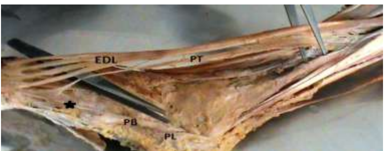
Figure 3: Lateral view of lower part of leg and foot showing distal attachment of PT and elongated tendon of peroneus brevis